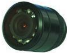
Model: FT-318C1 (420TVL)