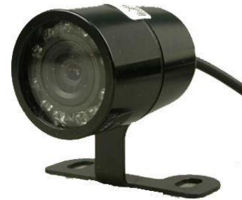
Model: FT-325C2 (480TVL)

Feature: Waterproof, Anti-Vibration, Cold resistant, side view camera, Led Light