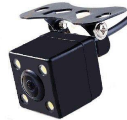
Model: FT-323C2 (480TVL)