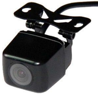
Model: FT-324C2 (480TVL)