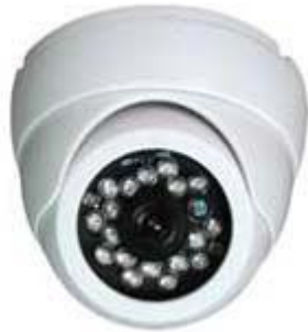
Model: FT-120C12 (1080P)